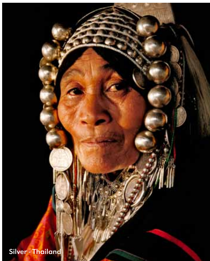
Silver - Thailand