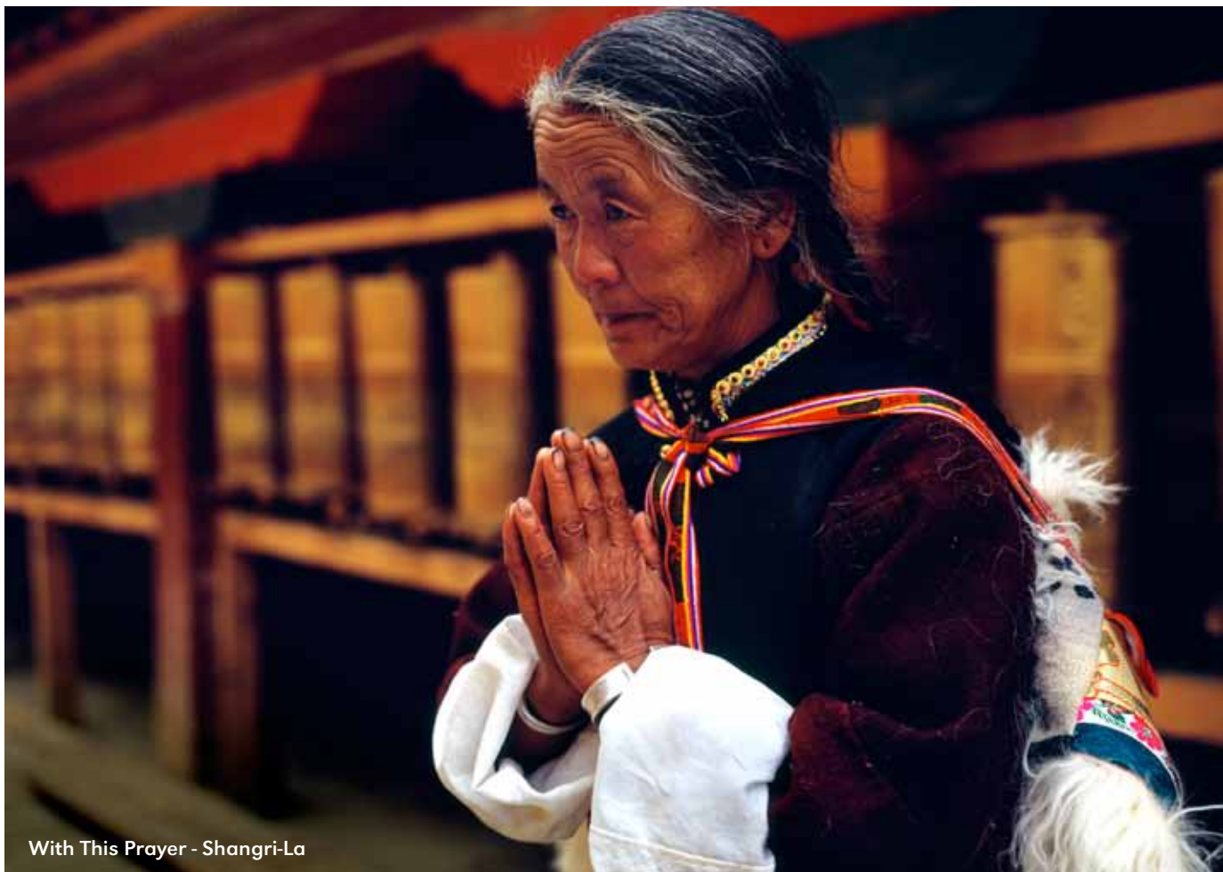
With This Prayer - Shangri-La