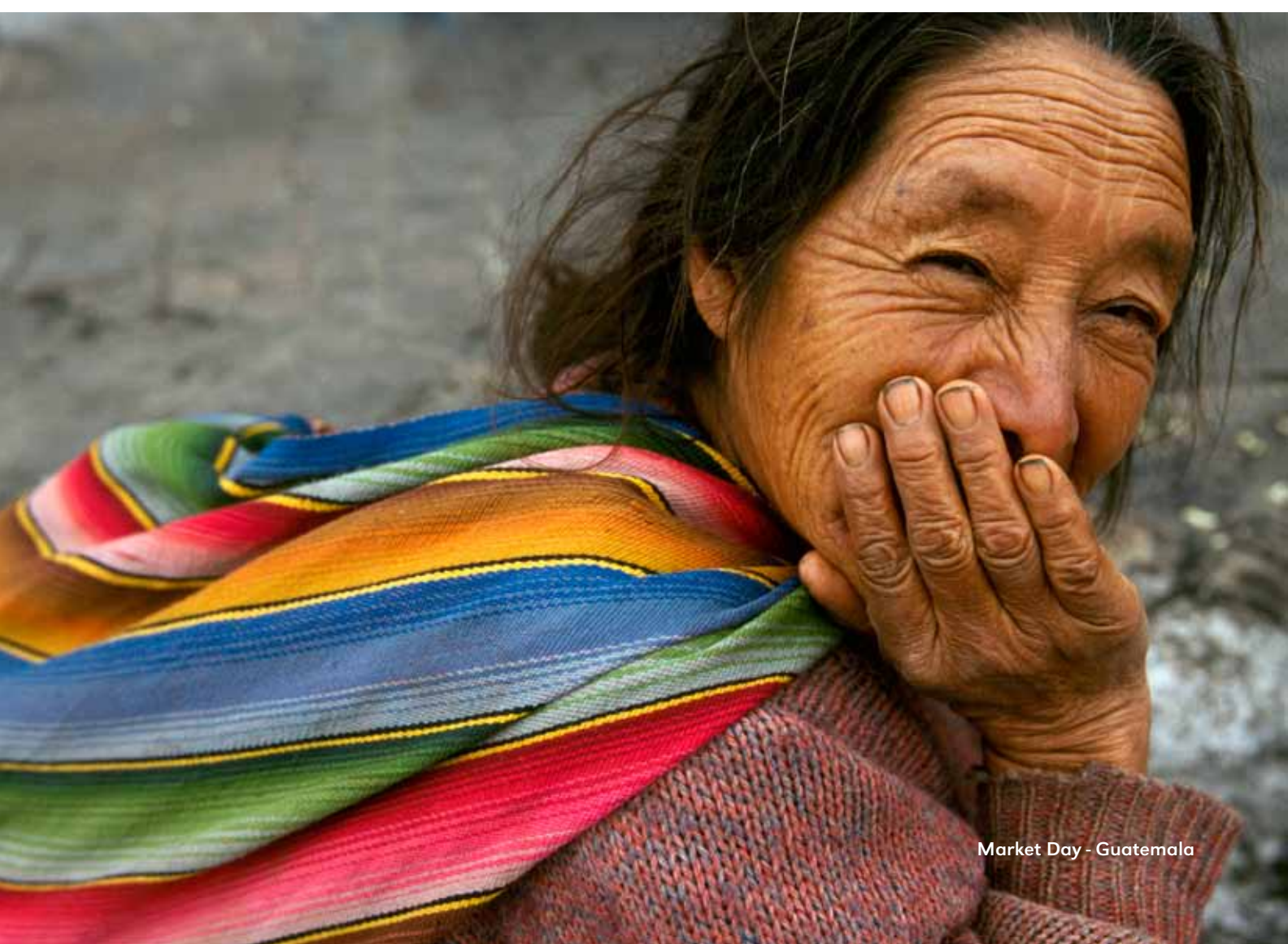
Market Day - Guatemala