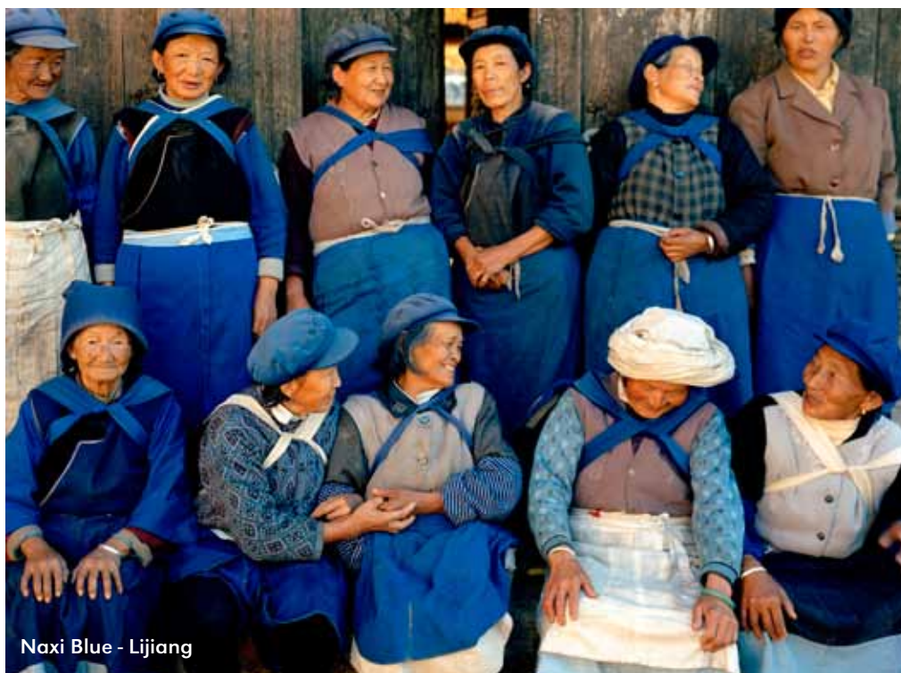
Naxi Blue - Lijiang

Tickets are available through the Maui Arts & Cultural Center, 808-242-SHOW (7469). For more information on these and other TEDxMaui speakers, visit www.tedxmaui.com .