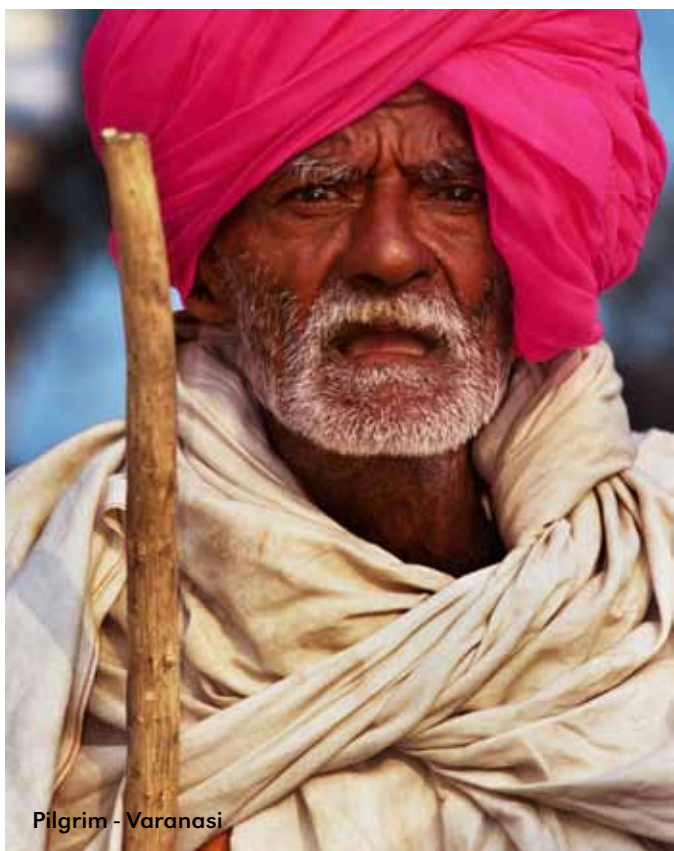
Pilgrim - Varanasi